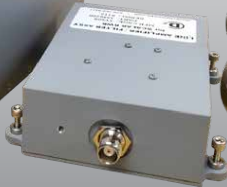
LINE AMPLIFIER / FILTER ASSEMBLY